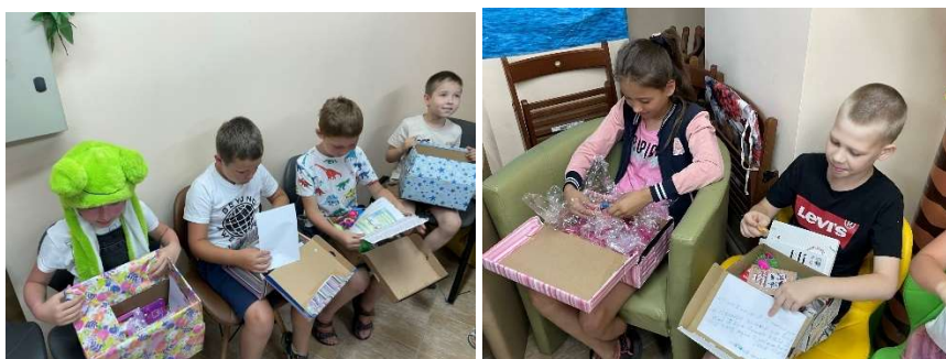
Gift boxes from John Clare School, delivered to Ukrainian children in Gliwice, Poland, July 2022

Several schools in Peterborough, Stamford, Oundle, Dronfield, Doncaster and Cambridgeshire are now directly involved in the project, collecting food and creating gift boxes for Ukrainian children.