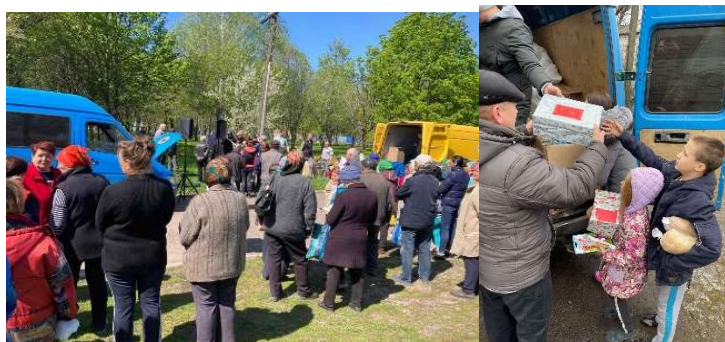
Food deliveries in Sumy Oblast