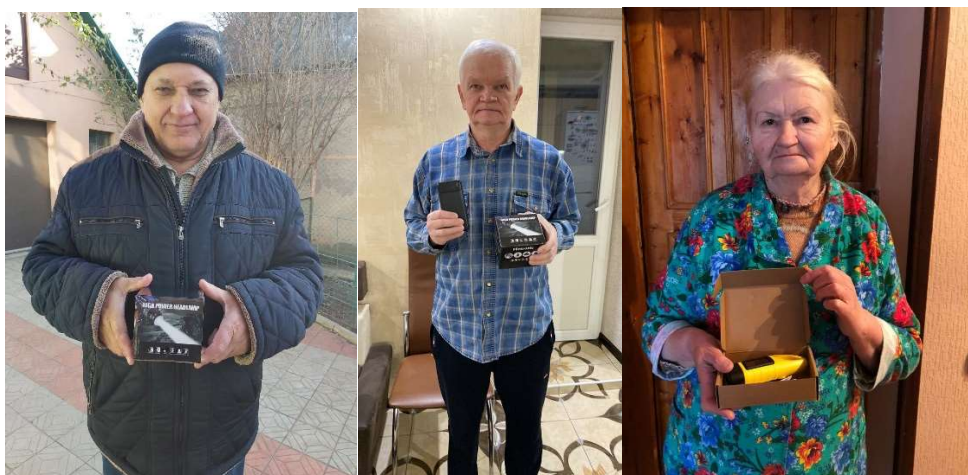
Deaf people in Kherson receiving torches and batter power packs, January 2023

In March, we also used the Ukrainian postal service to deliver Easter Gift Boxes to the charity. We put them in the post in Rivne on Monday afternoon, and they were in Odesa on Tuesday morning!