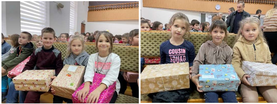
Handing out gifts to Ukrainian children near Rivne, Ukraine, 5 December 2022