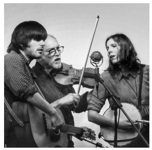
The Mountain Drifters