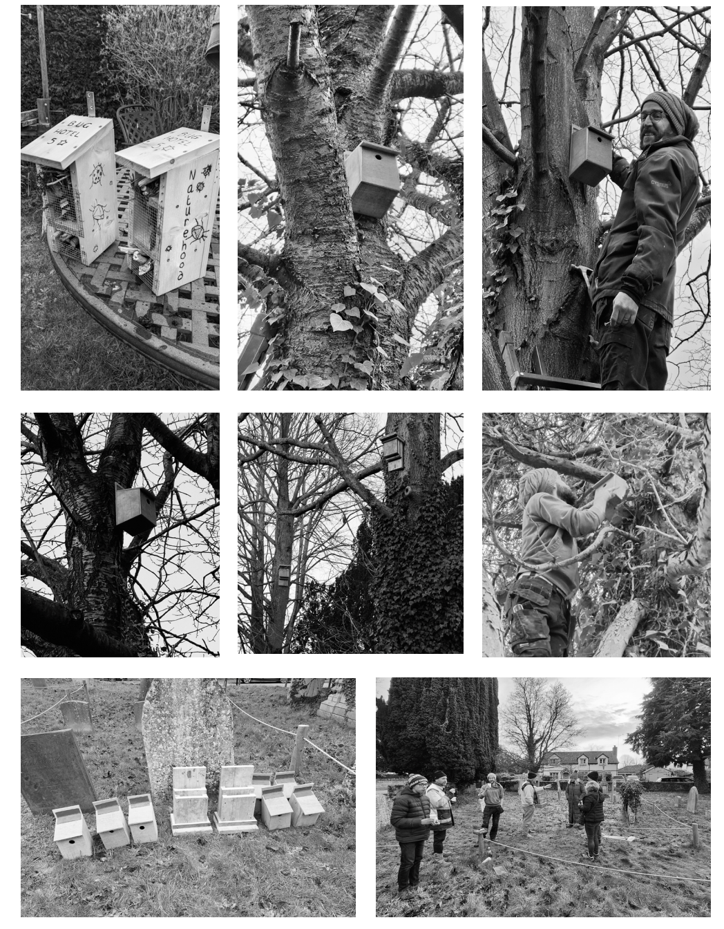
See page14 'Nature Watch'.